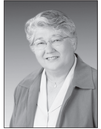
Mayor Charmaine Tavares